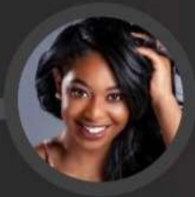
Salon and Barbershop