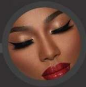
Lashes and Microblading